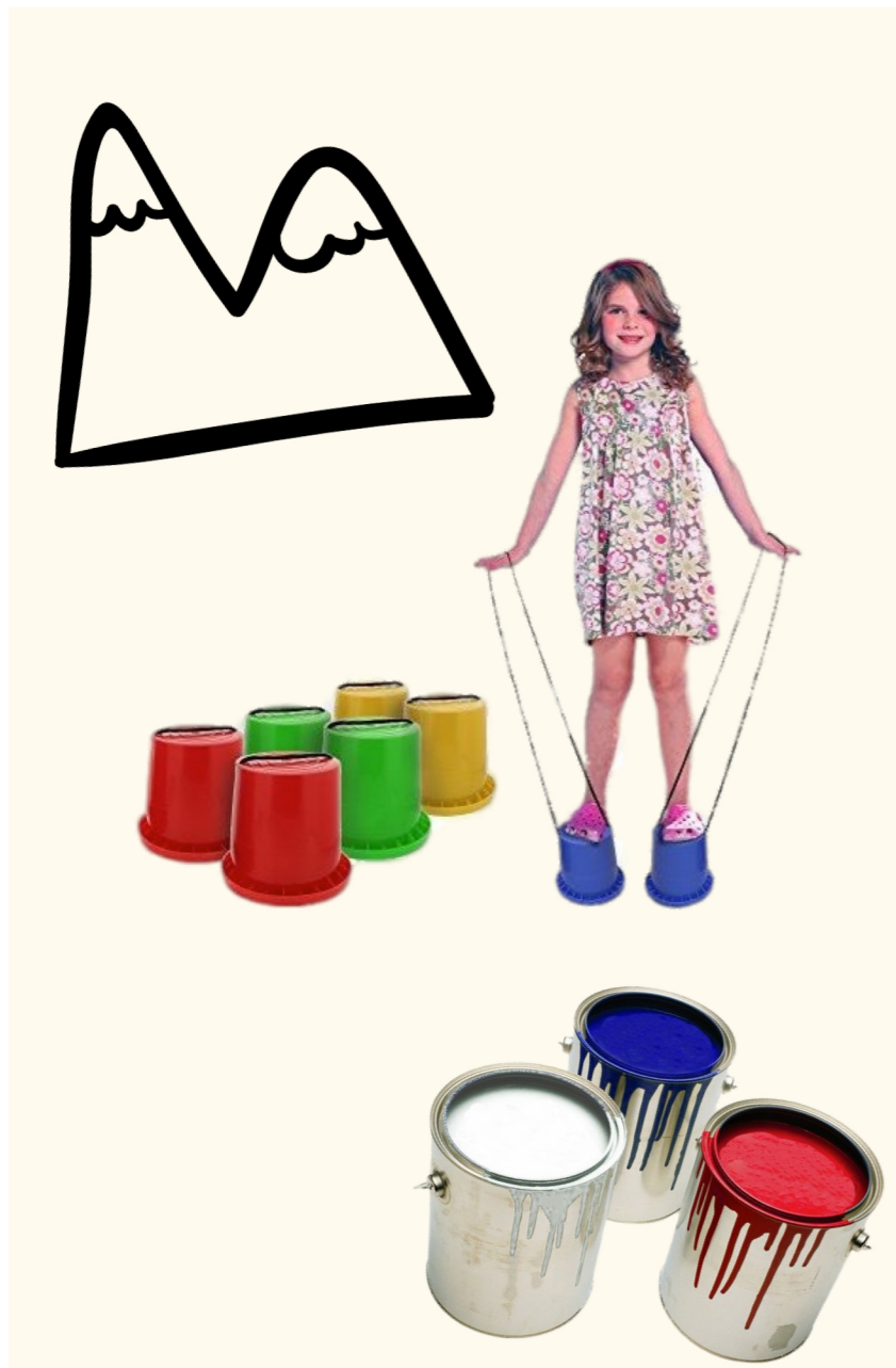
“Circus Stilts” made from used cans and string.